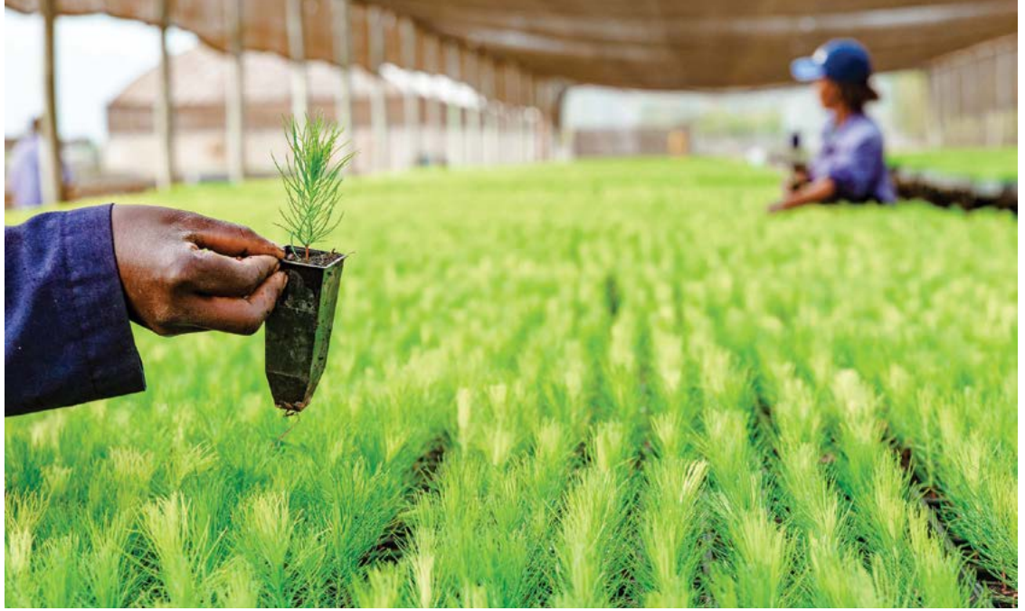
Image: A nursery in Africa