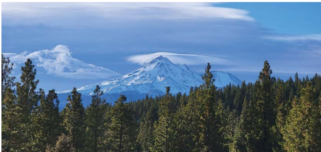
Image: Mount Shasta United States